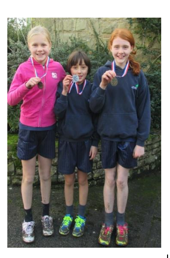
Year 6 Boys medallists

Well done to all the children from Y3 to Y6 who took part in the Cross Country Tournament last Thursday and to the Y6 children who marshalled the event. We had many individual successes in terms of medals but also children showing great determination to do their best. The Allendale Primary children were the overall team champions.